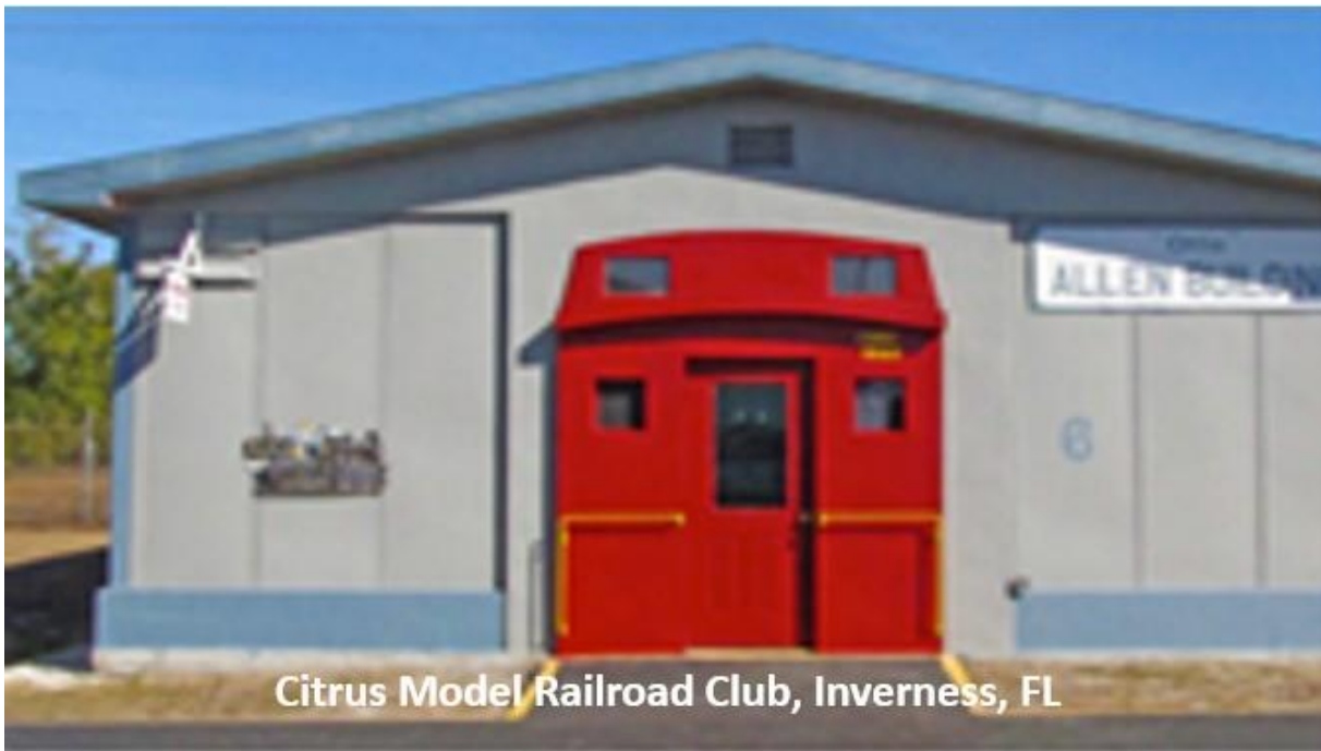
Citrus Model Railroad Club, Inverness, FL